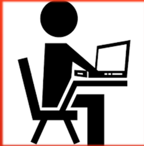
Device Policy in the Classroom