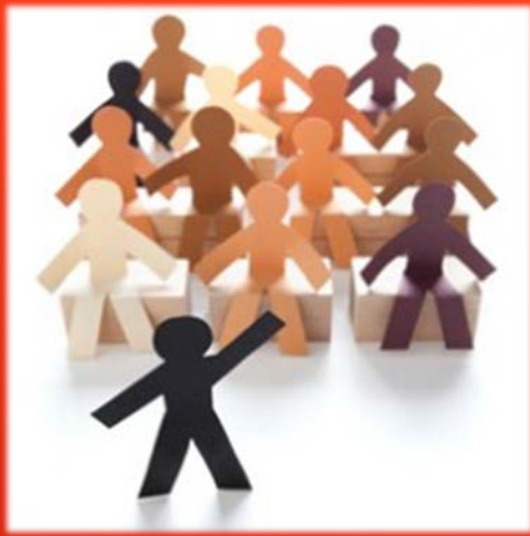
Differences Among International Students