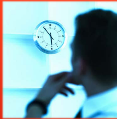
Engaging Students Mid Session